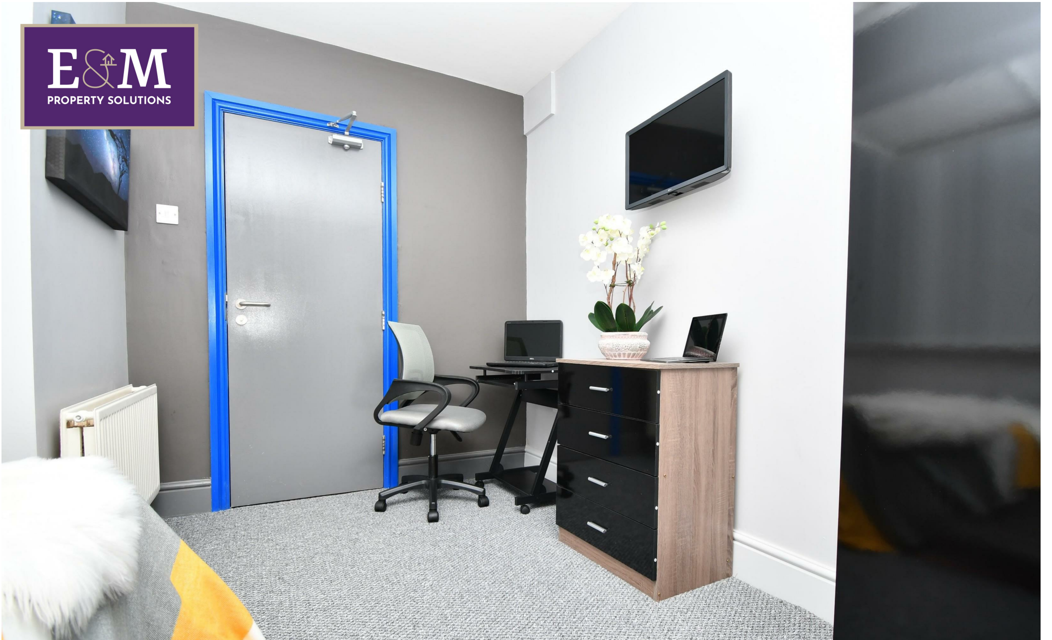
Room 5, 7 Pedder Street, Ashton-On-Ribble, Preston, Lancashire, PR2 2QH £110 Per week